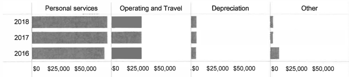
Figure 3. Southeast Community College Area Expenses (in thousands of dollars)