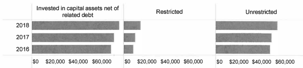
Figure 1. Southeast Community College Area Net Assets (in thousands of dollars)

These two statements report the College's net assets and changes in them. You can think of the College's net assets (the difference between assets and liabilities) as one way to measure the College's financial health, or financial position. Over time, increases or decreases in the College's net assets are one indicator of whether its financial health is improving or deteriorating. You will need to consider other nonfinancial factors, however, such as enrollment trends, placement results, program quality, condition of buildings, campus safety and other factors to assess the overall health of the institution.