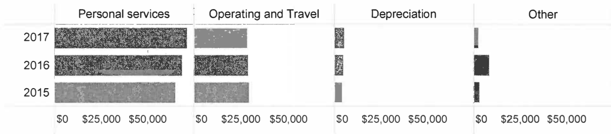
Figure 3. Southeast Community College Area Expenses (in thousands of dollars)