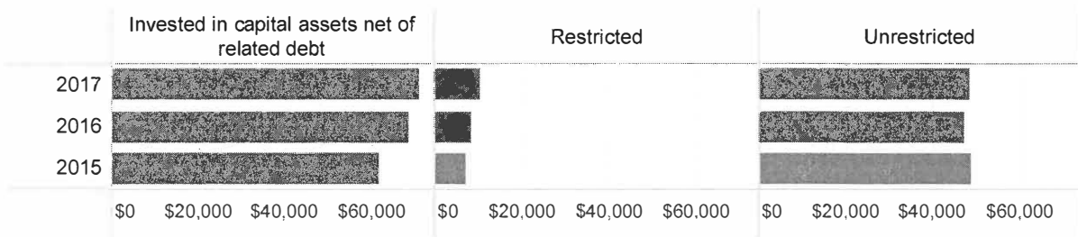
Figure 1. Southeast Community College Area Net Assets (in thousands of dollars)

These two statements report the College's net position and changes in them. You can think of the College's net position (the difference between assets and liabilities) as one way to measure the College's financial health, or financial position. Over time, increases or decreases in the College's net position are one indicator of whether its financial health is improving or deteriorating. You will need to consider other nonfinancial factors, however, such as enrollment trends, placement results, program quality, condition of buildings, campus safety, and other factors to assess the overall health of the institution.